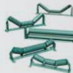
U Rex Conveyor Idlers