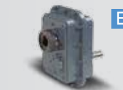
E Falk® Quadrive® Shaft-Mounted Gear Drives