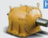
H Rexnord Planetgear™ Speed Reducers