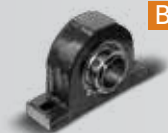
B Rexnord SHURLOK® Adapter Mount Spherical Roller Bearings