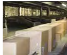
Warehouse & Distribution