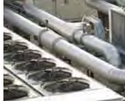
Air & Fluid Handling