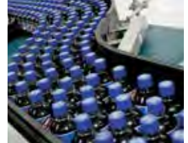
Beverage & Liquid